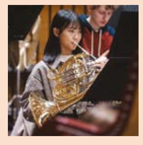
Youth Orchestra: Mahler 5

The brightest musical talents in the Midlands play epic Mahler.