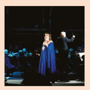
VALENTINE'S DAY CONCERT: TCHAIKOVSKY & BEETHOVEN

Love is in the air for our Valentine's Day concert. Wed 14 Feb, 7:30pm