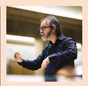
RHAPSODY IN BLUE

Broadway comes to Broad Street: tune after tune after tune... Fri 16 Feb, 7:30pm