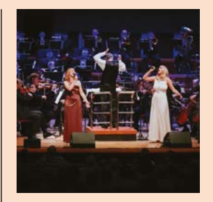
BEST OF BROADWAY

Love is in the air for our Valentine's Day concert. Wed 14 Feb, 7:30pm