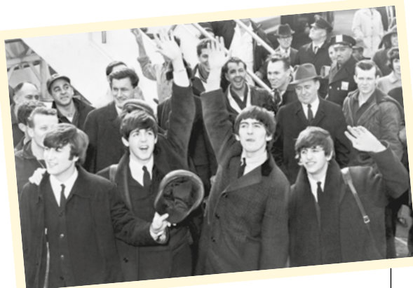
THE BEATLES ARRIVING AT JOHN F. KENNEDY INTERNATIONAL AIRPORT, 7 FEBRUARY 1964.

Re-live, re-visit or simply discover the great songs of the 'fab four' through this glorious celebration of their music.