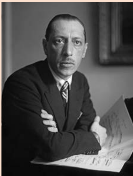
PHOTOPORTRAIT OF IGOR STRAVINSKY, C. 1920.

The piece is in two parts. In the original ballet, the first comprised a series of ritual dances intended to celebrate the arrival of spring; the second the process of choosing a girl to sacrifice, and her dance to the death. The original collaborators took some care to render the rites of The Rite as ethnographically authentic as possible, though the sacrifice of a young maiden seems to belong more to the tradition – in ballet, as well as in opera – of a female character dying at the end (there were no such actual rituals in the Russian tradition). As some have suggested, there is both a primitive quality to The Rite and a unflinching, modernist element. Both combine to unsettling effect in the violent conclusion.